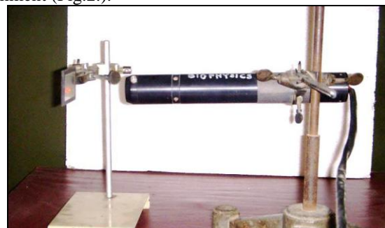
Fig.1. Experimental setup

Also, specimens were examined under trinocular microscope and micrographs were taken using digital camera with attachment (Fig.2.).