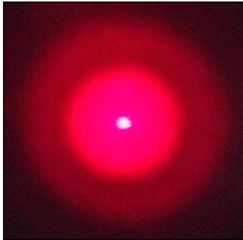
Fig.2. A typical laser diffraction pattern of human Erythrocytes