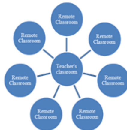
Figure 1: V-class room network

In the proposed system, the training entity enrolls expert teachers at different locations into a virtual team and organize remote training programs for different topics under one banner. It also enrolls facilitator entities which collect trainees into classrooms at distant locations into a network of classrooms. The training entity, the facilitator entity and empaneled teachers all share revenue generated from training at pre-agreed tariff rates. Facilitators can enroll students for specific classes by collecting charges from students and remitting relevant charges through vClass's electronic payment gateway interface. System sends automatic reminders of the schedule to and students on their mobile phones. When teachers start a session the system automatically calls participant classrooms to join video conference. The students participate in remote classrooms can observe, listen and interact with the teacher virtually as an extended class room while teacher conducts the session.